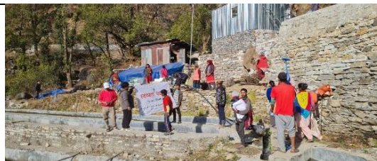
A village in Dharchula block