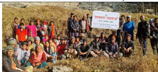
In Dharchula block