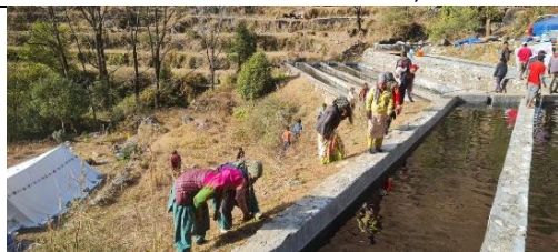
A village in Dharchula block