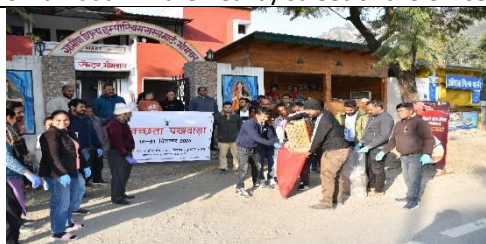
Activities near to Saras Market, Bhimtal