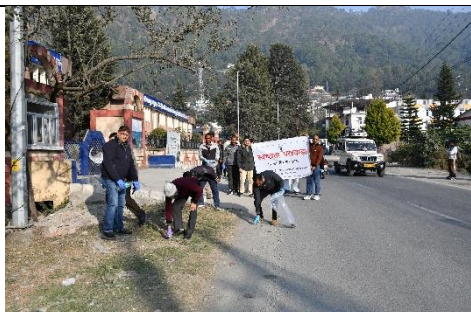
Shramdaan in the nearby street of the office